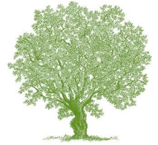
GREENWOOD TREE ACADEMY TRUST