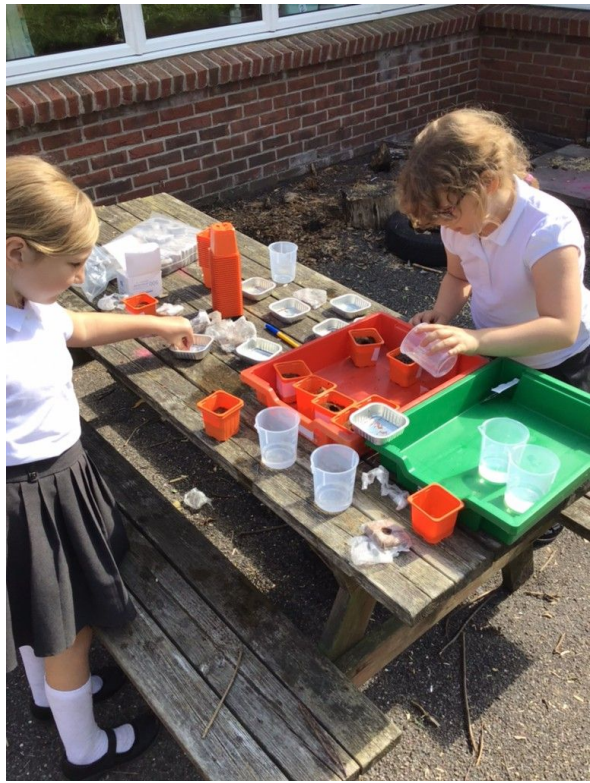
Raccoon Rangers as scientists growing cress and discovering magnetic inventions