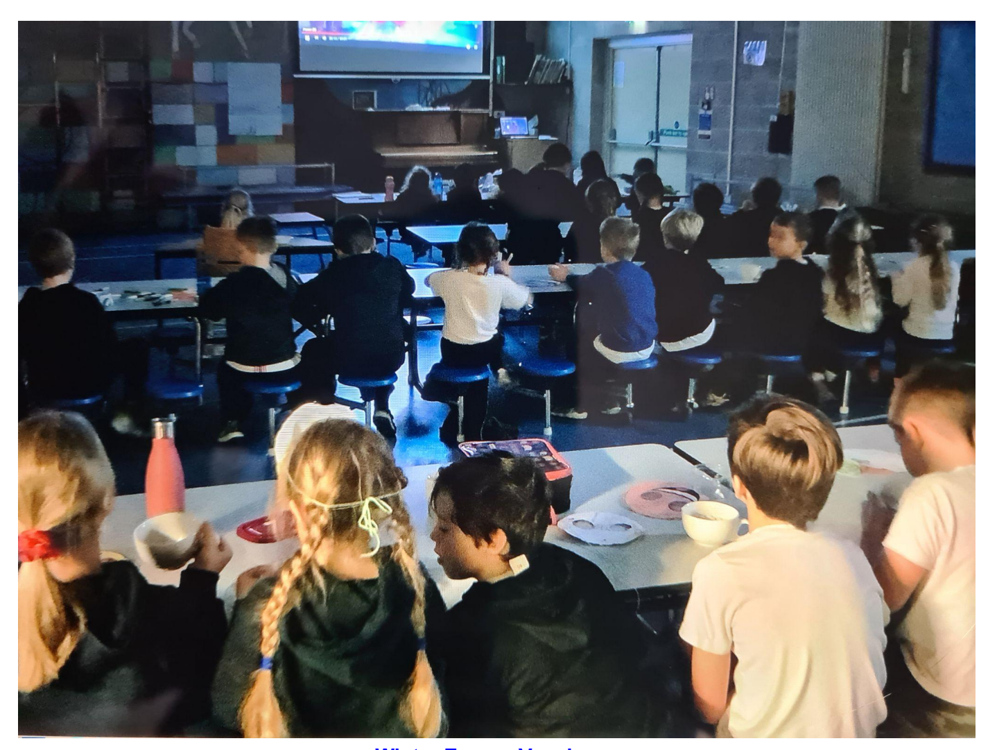
Winter Energy Voucher:-

Christmas can put extra strain on family budgets, I wanted to make sure that no one misses out on support available. To that end, if you think you might be eligible for a winter energy voucher, please apply below.